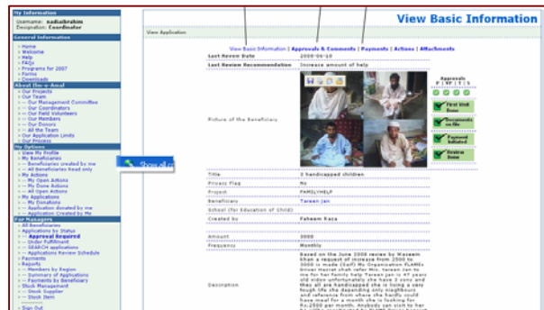
Beneficiary Management System

It requires a valid 'Username' and 'Password'. It is hosted in a secured environment. It is developed with software tools under GNU Public License including PHP and MySQL database